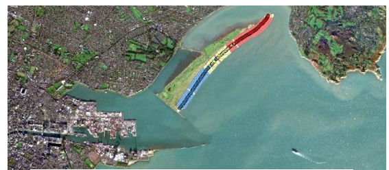
Bull Island, (ROI) case study using S1 SAR

In addition, the use of Sentinel-1 SAR derived waterlines has been fully exploited and can in many cases show erosion or accretion trends based on a number of demonstration sites. Despite the numerous challenges related to SAR technology, isardSAT have developed an innovative approach to capturing the dynamic interface between land and sea to clearly demonstrate coastal change via time series. The repeatability and number of observations make SAR technology optimum for identifying coastal change in challenging environments.