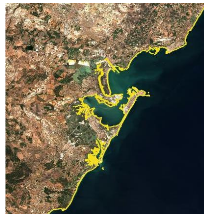
Waterline in Catania, Italy

An Executive Summary For the past 3 years a specialist consortium comprising the national geological and environmental/hydraulic experts from five nations have joined with specialists from industry in Earth Observation exploitation to design, develop, test, manufacture and validate a series of Earth Observation products. These products comprise accurately positioned waterlines , ie the land/sea boundary at the time of the satellite passing, shorelines , ie a waterline projected to a specific datum such as Mean Sea Level and Coastal Land Cover maps to identify the nature of the backshore area. These products identify historical coastal change over 25 years, employing both SENTINEL 1 & 2 mission alongside Landsat by providing real evidence to inform risk assessment and determine where future investment in sea defences, beach renourishment or managed realignment should occur. The intended customers for these product outcomes are those engaged in managing coasts, the insurance associated with coastal investment, planning and coastal engineering work.