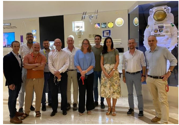
Final review meeting in ESRIN-ESA, Frascati

The Project Partners This project has been led by ARGANS Ltd who formed a partnership consisting of an EO based information service provider group of Earth Observations and Data experts comprising ARGANS Ltd (UK/Fr), isardSAT (Spain) and adwaisEO (Luxembourg) who delivered to an authoritative public User Group of national representatives from the British Geological Survey, the British government experts, IHCantabria in Spain on behalf of the Spanish government's Ministerio para la Transición Ecológica y el Reto Demográfico (MITECO), Geological Survey Ireland, the Irish Department of Environment, Climate and Communications and ARCTUS representing the Canadian academic world and the local communities of Québec. For the CCN an additional national expert from Italy was added to the consortium, namely the Italian National Institute of Environmental Protection and Research.